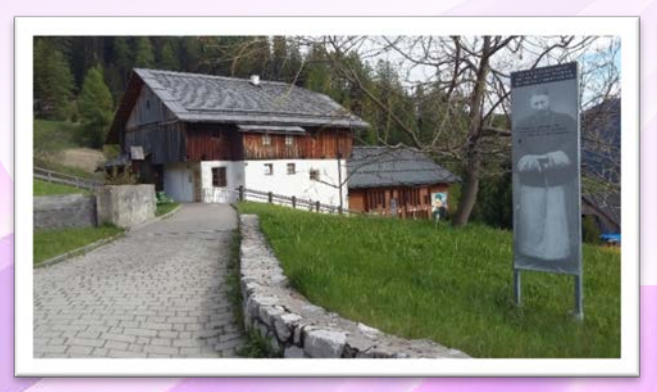
It. Lough House